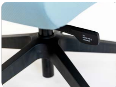
Gaslift Height Adjustment