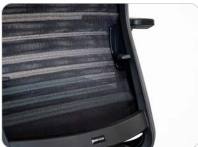
Adjustable Lumbar Support

There are four cushion colors and three chair frame colors available within the FAST Program, allowing for 12 colorways to find the perfect combination for every project.