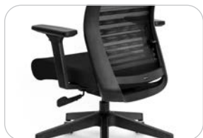
Black Frame + Black Back