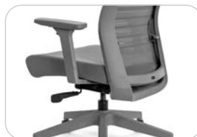
Gray Frame + Gray Back