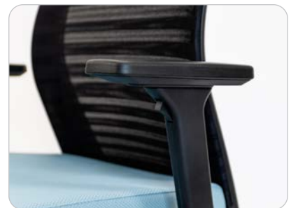
3D Adjustable Armrests

Create your look with 12 unique color combinations.