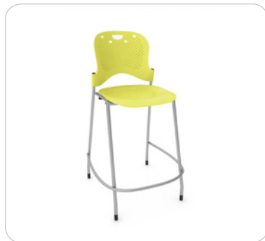
1: Blaze Stool