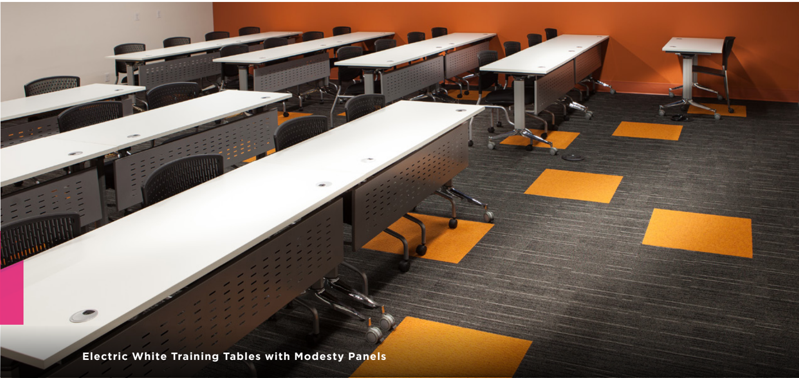
Electric White Training Tables with Modesty Panels