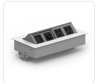
3: In-Surface Power Module