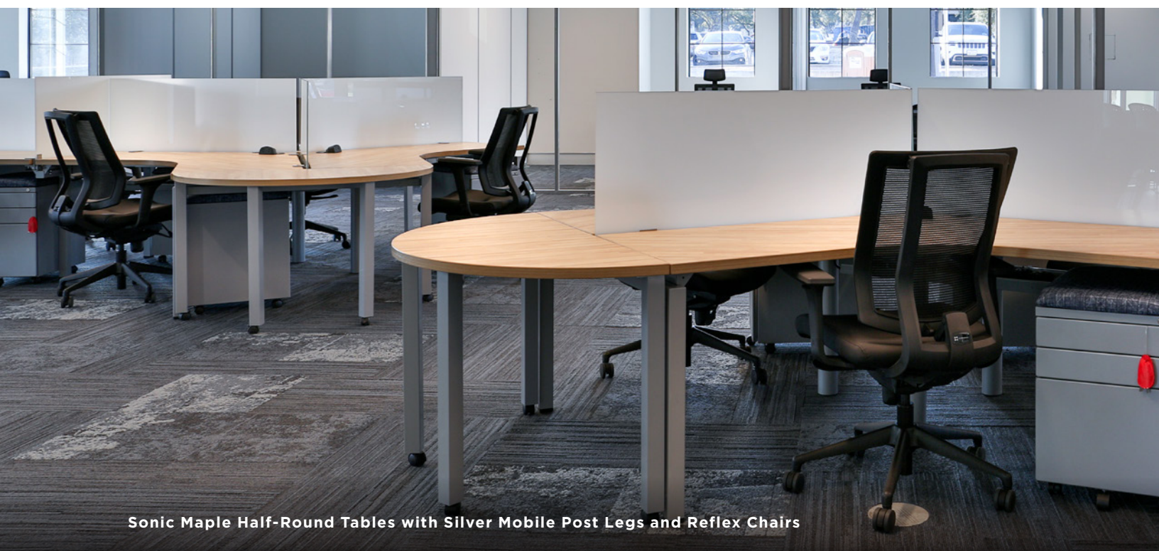
Sonic Maple Half-Round Tables with Silver Mobile Post Legs and Reflex Chairs