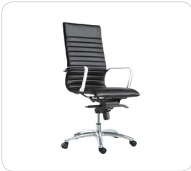
1: Vogue Chair

THREE60 was created with the modern workplace in mind. Offering scalable solutions for a wide variety of conference rooms sizes, integrated and flexible wire-management options, and power/data/video connectivity, it is your ideal solution for conference, meeting, and collaboration spaces.