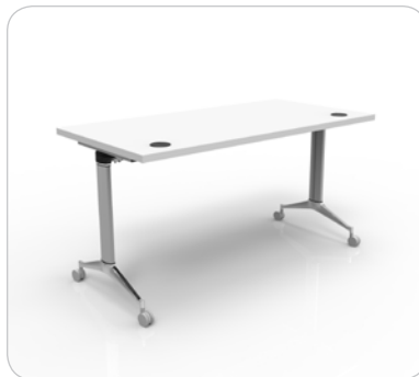
2: Training Table