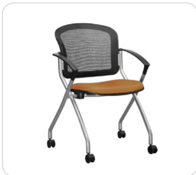
1: Ice Chair