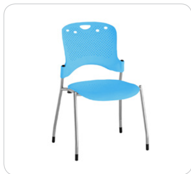
1: Blaze Chair