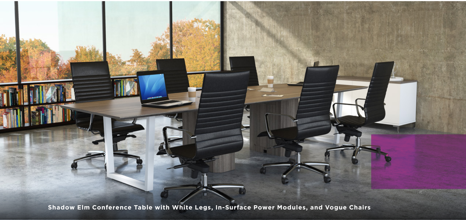
Shadow Elm Conference Table with White Legs, In-Surface Power Modules, and Vogue Chairs