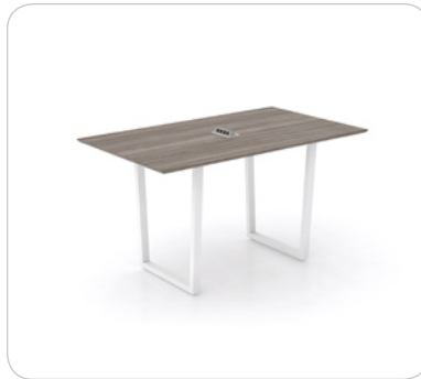
2: Standing-Height Table