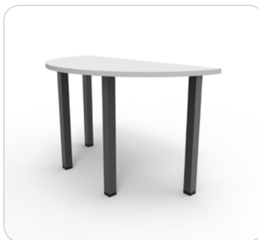
2: Stationary Post Legs