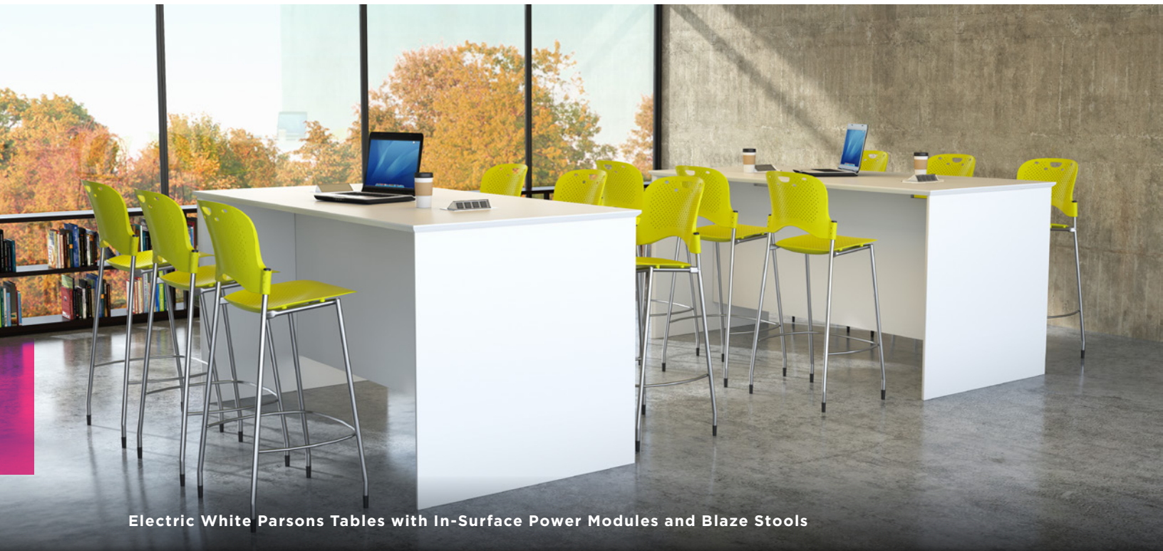
Electric White Parsons Tables with In-Surface Power Modules and Blaze Stools