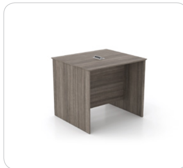
2: Parsons Table