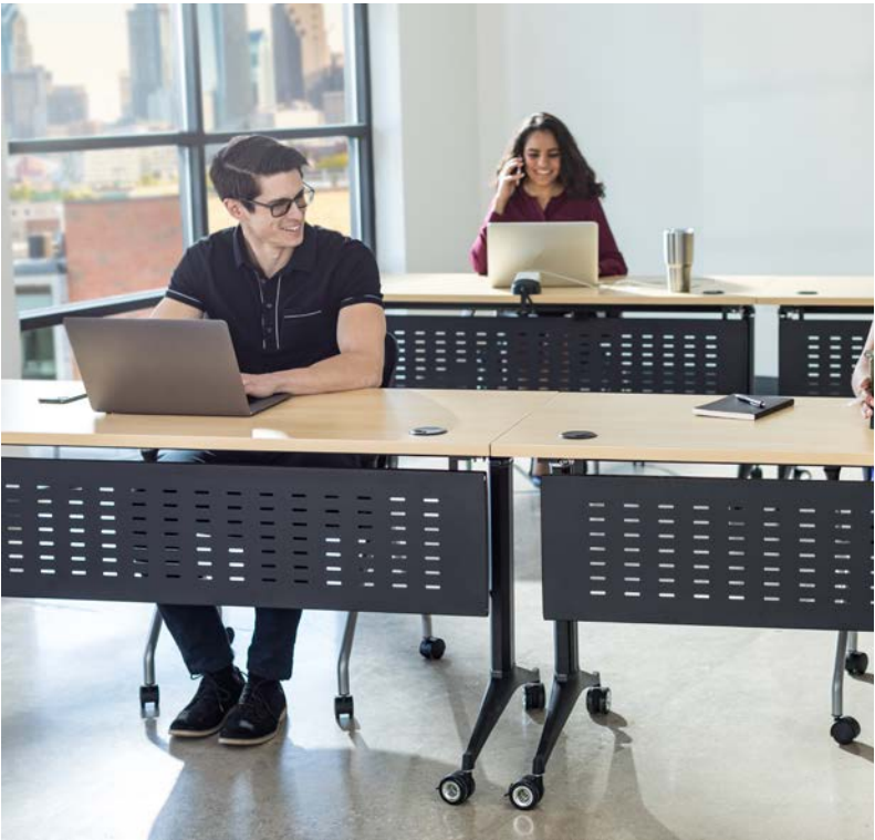
Optional Modesty Panel